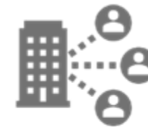
MEMBER CLUB BREAKDOWN